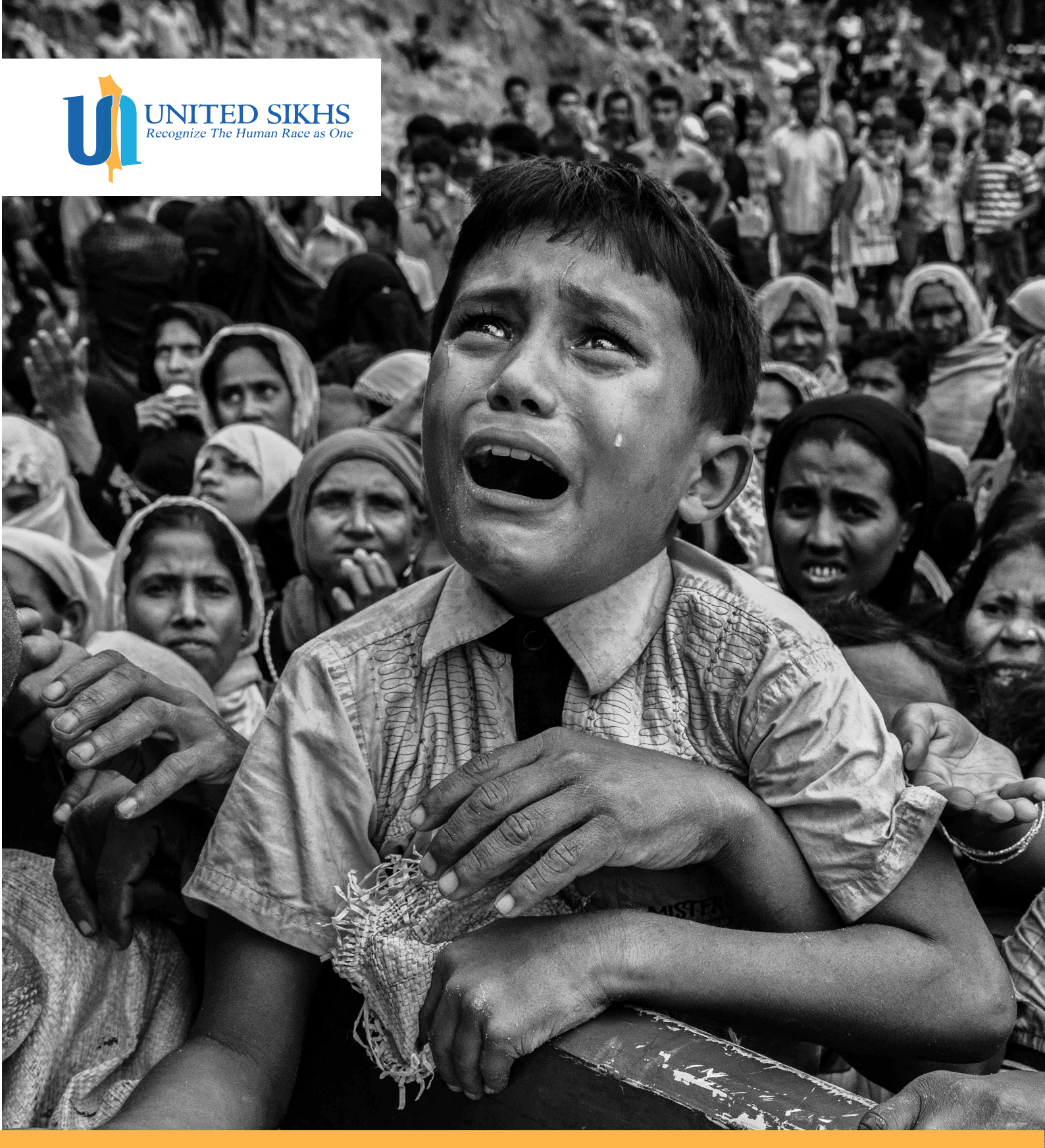
Rohingya Refugee Humanitarian Aid Assistance Project Report – 2017-18