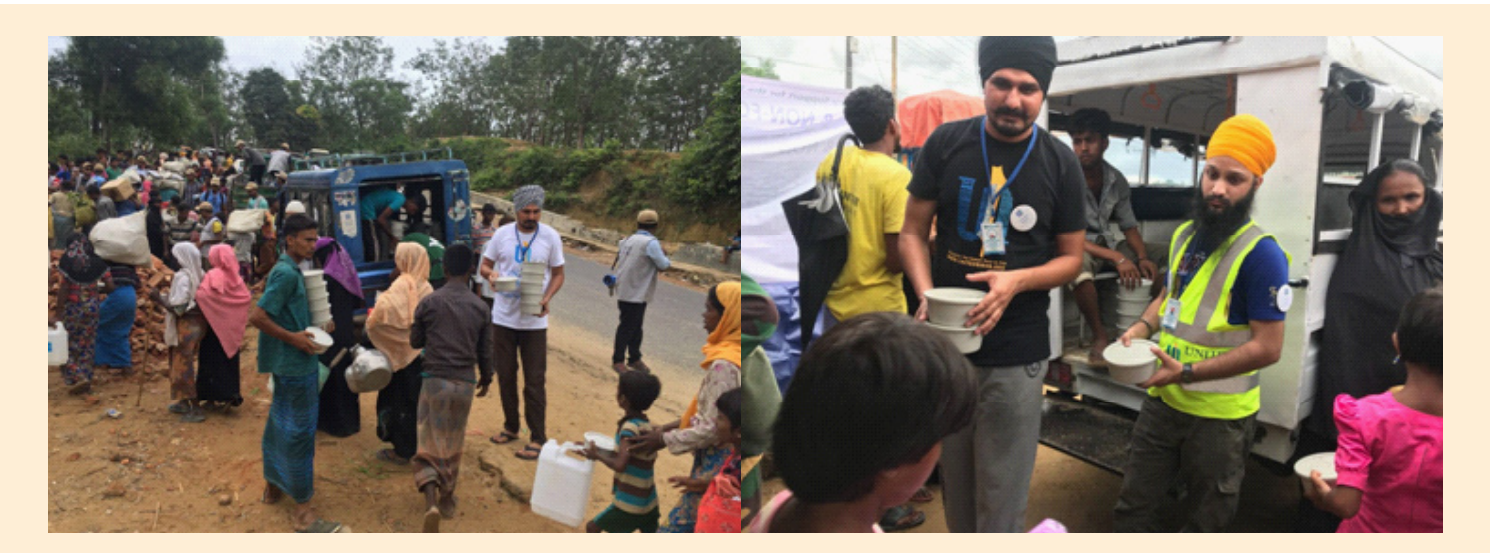
Volunteers mobilizing Langar on the roads and at campsites.

As people walk closer to the camp, UNITED SIKHS volunteers are stationed at the entrance to meet the new arrivals with warm meals. Often, it is the first warm meal the people have received since beginning their arduous trek towards safety. For a small moment, hunched shoulders, burdened by the trauma of displacement, straighten and joy spreads as they share a warm meal.