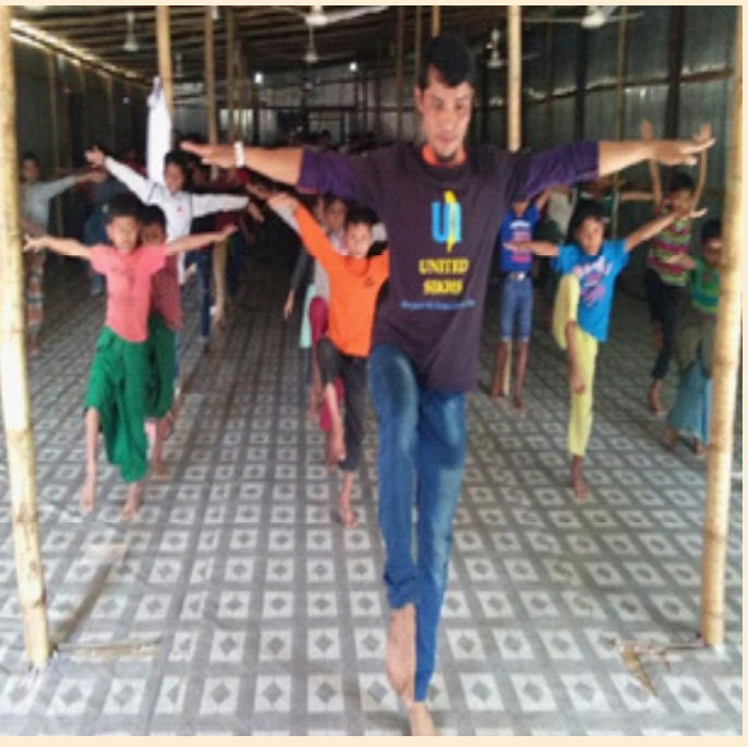
Trainer helping children to stretch & exercise.

The current reality of the Rohingya people is dire; their suffering is testimony to how manmade divisions and conflict can leave a person shattered and helpless. However, our team has seen incredible resilience in the eyes of the Rohingya people.