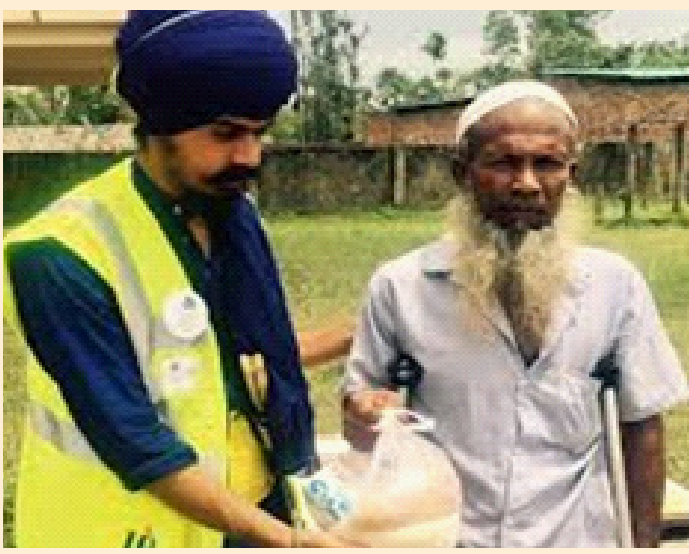
Right: Volunteer helping disabled man with the food.