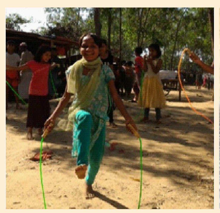
Girl laughing and playing in the camp.