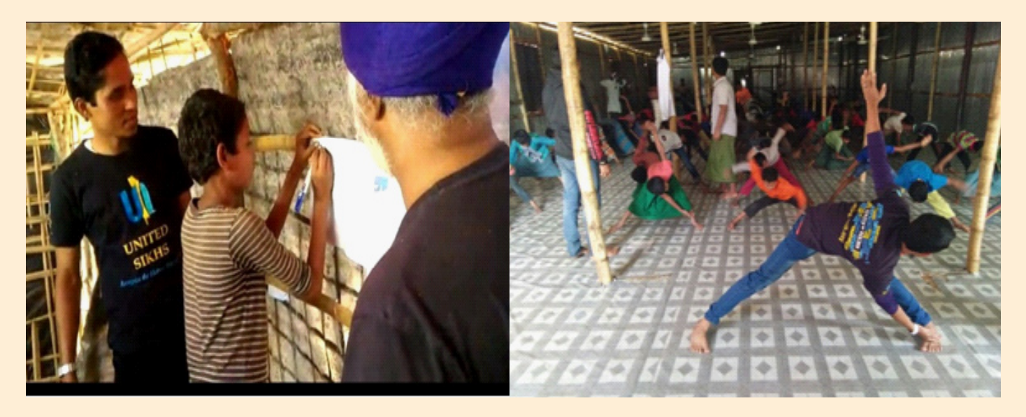
Children learning in the class