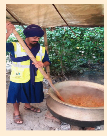
Volunteer making Langar at campsite.