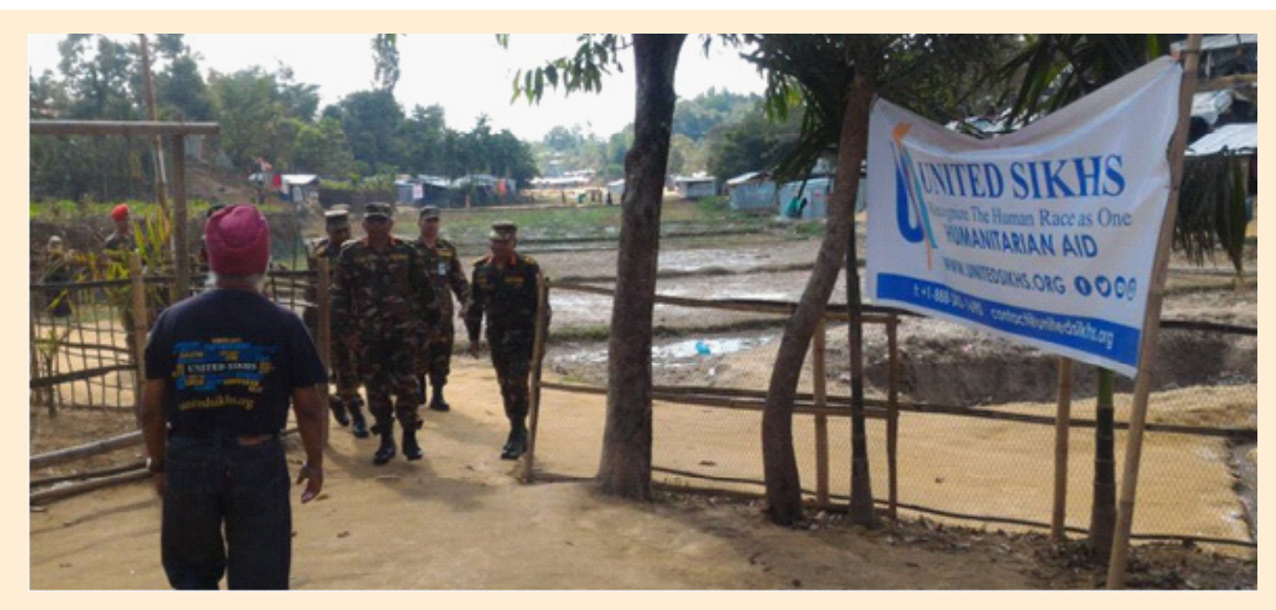
Border Guards Bangladesh (BGB) walk in to inspect the camp, L: UNITED SIKHS volunteer.