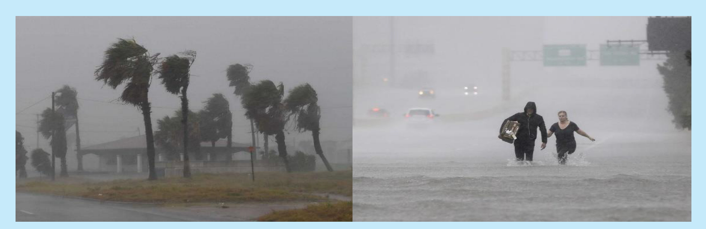
Impact of Hurricane Harvey.

Hurricane Harvey Impact: In U.S. history, there's never been a storm like Hurricane Harvey. A fact that became increasingly clear with the falling rains and rising water level in Houston.