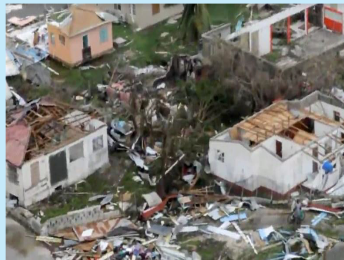
Glimpses of Hurricane Harvey

Rescue Operations - Florida: UNITED SIKHS continues to support residents during this challenging process and has adopted several areas in Florida. In these areas, Hurricane IRMA toppled power lines, tore up roofs and threatened coastal areas with storm surges as high as 15ft! Near Mile Marker 10 on U.S. Highway 1. UNITED SIKHS, being a