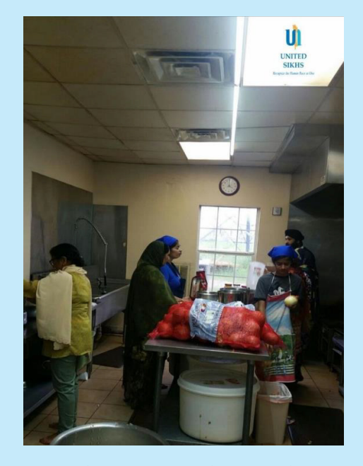
Langar being prepared at Gurudwara