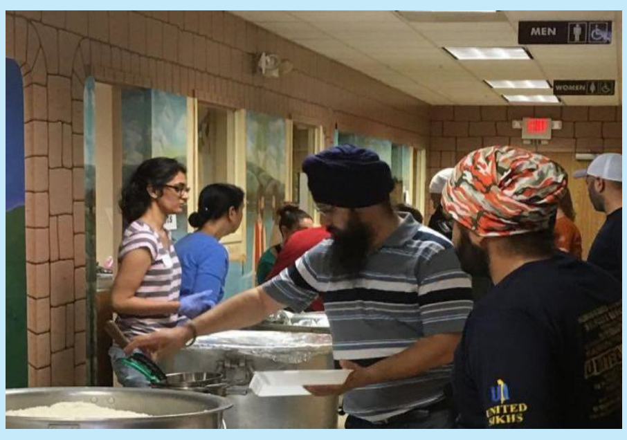
Langar prepared at National Center in Houston.UNITED SIKHS volunteers packed the food and went to the affected neighborhoods to distribute it.