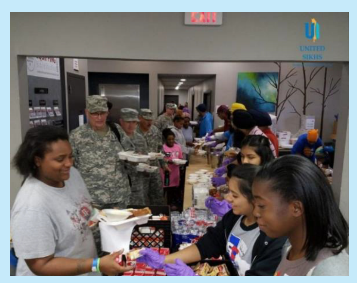
Langar being distributed at the shelters by UNITED SIKHS Volunteers.

UNITED SIKHS purchased essential items for distributing to affected family in Houston. Food supplies and goods worth of $200,000 were bought for the relief & rescue operations.