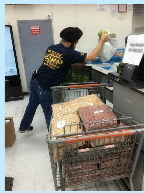
Raw material being bought to prepare Langar at Houston.