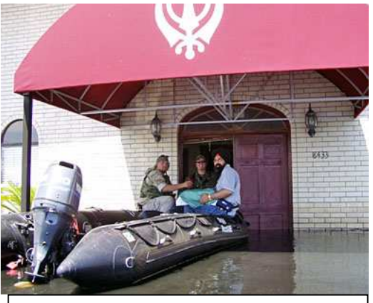
UNITED SIKHS volunteers with the Response Team

For the work done and for more information see: http://unitedsikhs.org/katrina/