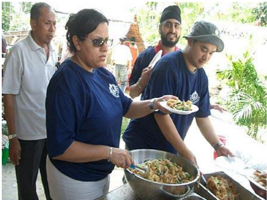
Photograph 2. Volunteers serving Langar.

Along with the relief effort with Hi Phi Phi, UNITED SIKHS and "Mae Ta Tham", a Thailand based humanitarian Organization, represented the Sikhs in an "Inter religious" prayer organized by Thai government on Jan 19th, at Khao Lak. Thousands of people from various faiths including Buddhists, Christians, Sikhs, Muslims and Jews joined in the prayer service. 20,000 lanterns were lit and sent up into the sky as a sign of hope and prayer.