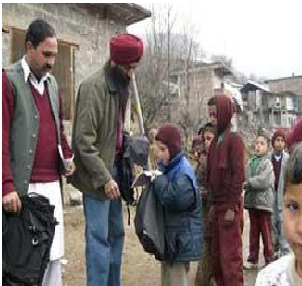
UNITED SIKHS volunteers distributing schoolbags to schoolchildren in Bagh, Pakistan, whose schools were demolished during the Asian quake, killing many students.