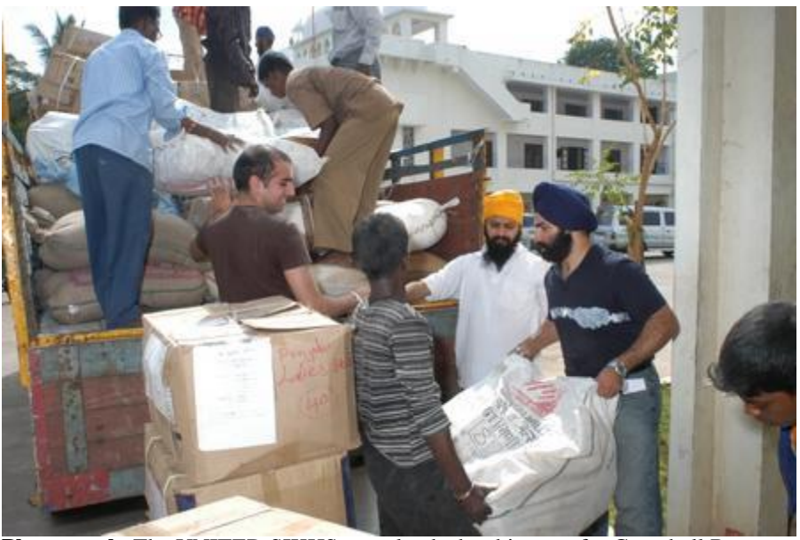
Photograph. The UNITED SIKHS team loads the shipment for Campbell Bay.

To make a donation please visit: <u>http://www.unitedsikhs.org/donate/</u> Issued by: Kuldip Singh Director UNITED SIKHS