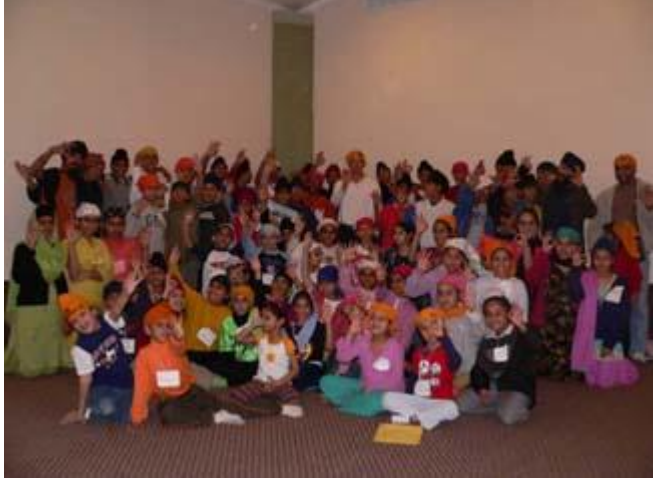
Sikh Youth Camp, Dallas 2005

UNITED SIKHS has clearly left its mark as a Sikh Eagles group has been formed at the Gurdwara to continue the activism and to ensure that the spirit of Sikhi continues to inspire and encourage these children who are indeed the future of Sikhism.